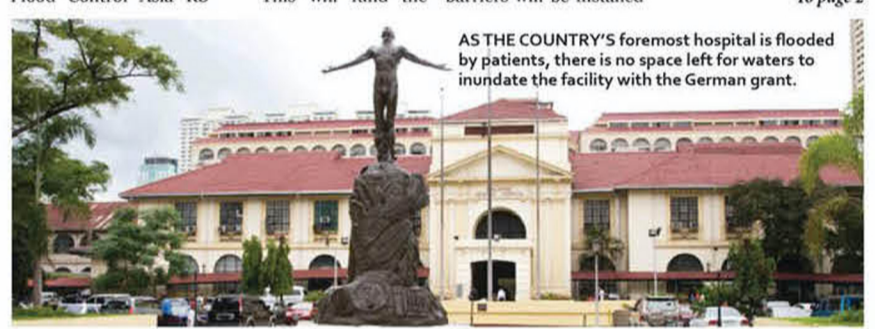
AS THE COUNTRY'S foremost hospital is flooded by patients, there is no space left for waters to inundate the facility with the German grant.